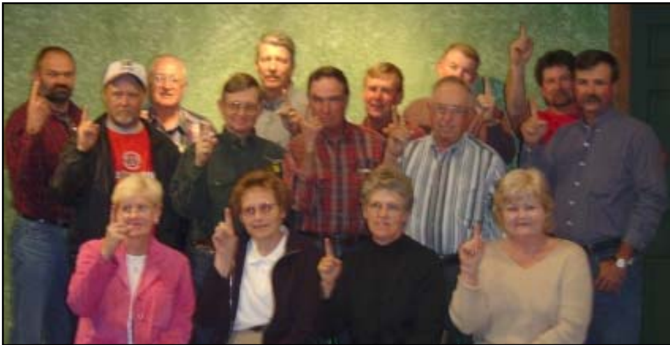
↑ Each of these members has committed to getting "Just One!" new member for the 2004 LICA membership Drive - how about you?

At its October 25 meeting, the Missouri LICA Board of Directors launched the Missouri LICA Chapter's participation in the Just One! LICA Membership Drive "Just One!" The theory is simple - if each member will recruit just one new member, we will double our size, strengthen our voice, and have a greater, positive effect on our industry!